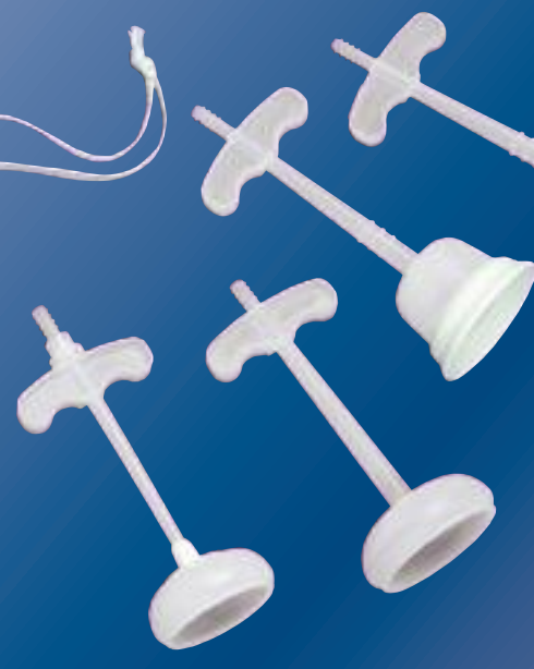
M-Style® Mushroom® Cup 10007LP