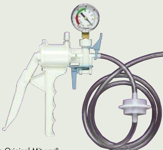
The Original Mityvac® Reusable Pump 10022