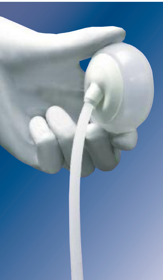
New low-profile M-Style cup