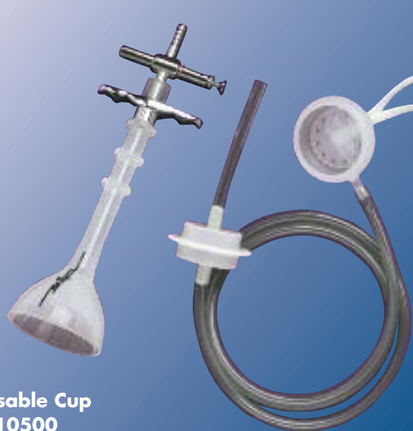
Reusable Cup 10500