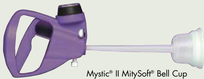
Mystic® II MitySoft® Bell Cup 10058